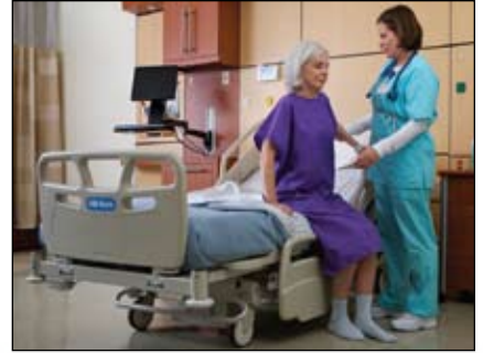
CareAssist® ES Bed