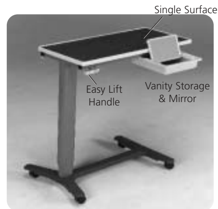
Standard Overbed Table