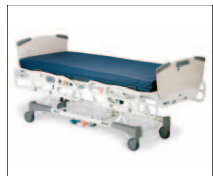
GOBED+ MODEL 2500