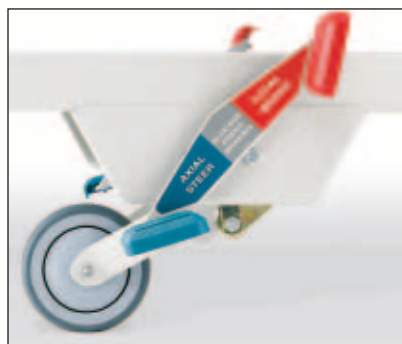
EXCLUSIVE FIFTH WHEEL AND BRAKING SYSTEM